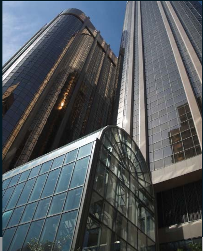
High Rise Buildings

The NFS2-3030 supports over 3,000 intelligent devices on ten Signaling Line Circuits (SLCs) – perfect for protecting high-rises, large manufacturing plants, or multiple campus buildings with a single panel. When additional protection is required, the NFS2-3030 can be expanded with additional panels using NOTI-FIRE-NET, NOTIFIER's intelligent fire alarm network.